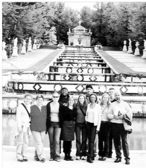
Students on a recent study abroad trip to Spain pose in front of a fountain in La Granja, near Segovia.